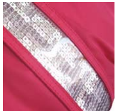
Delicate spangle part is covered by transparent PVC.