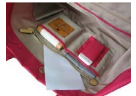
Useful organizer inside the bag.