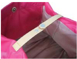
Convertible bag size by the hook.