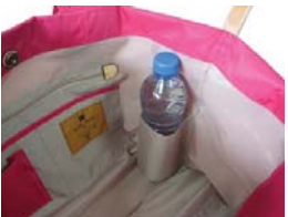
Bottle stand and zipper pocket inside the main room.