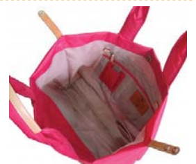
Large space in the main room.