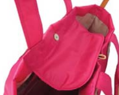
Magnet closed flap cover.