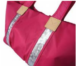
The nylon body material is coated by Teflon.