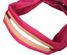
Reinforce the handle with Italian leather.