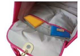
Many pockets inside the bag.