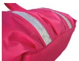
Tucks on the bottom make round shape.