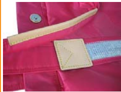
Using high quality Italian vegetable leather.