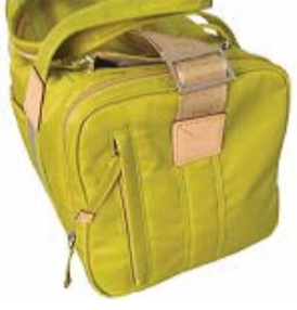
Zipper pocket on the right side gusset.