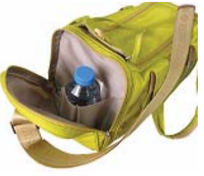
Bottle stand inside zipper pocket.