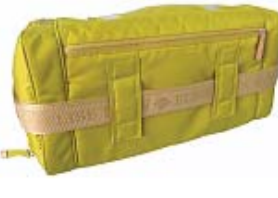
The shoulder belt holder on the bottom.