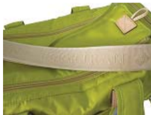
Thick and strong logo shoulder belt.