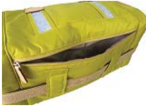
The gusset bottom has a fastener pocket for umbrella.