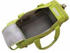
The flap close by double zipper and fastening tape.