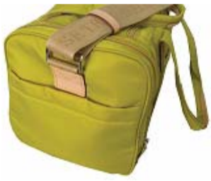
Small pocket on the left side gusset.