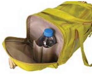
Bottle stand inside zipper pocket.