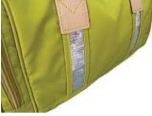
Delicate spangle part is covered by transparent PVC.