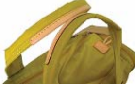
The handle reinforced by Italian leather.