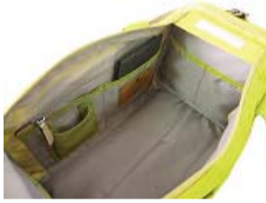
Useful organizer and many of small pockets inside the bags.