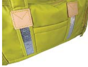
Small pocket on the front panel.