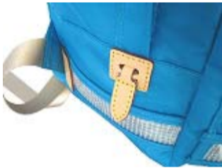
Adapted unique and functional design.