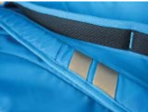
Comfortable shoulder strap with soft sponge backing.