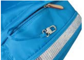
Useful key holder inside the pocket.