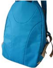
The back side is padded with thick sponge.