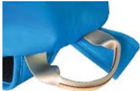
The handle reinforced by Italian leather.