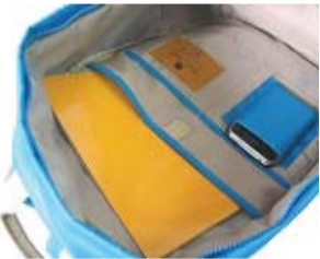
Useful organizer inside the bag