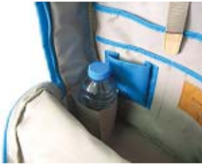
Useful bottle stand inside the bag.