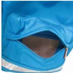
Small pocket inside the front zipper pocket.