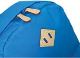
Using high quality Italian vegetable leather.