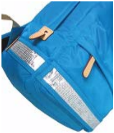
Delicate spangle part is covered by transparent PVC.